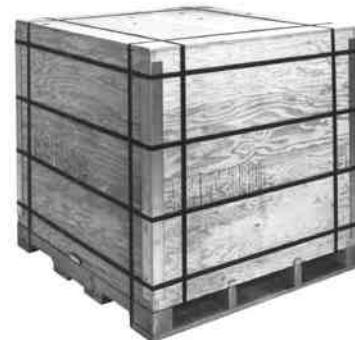
Signode steel strapping and plywood can be combined to fabricate 300 gal. (1140 l) storage containers used to store and ship a myriad of industrial products.

Zinc finish strapping is waxed and has a zinc enriched coating to provide outstanding resistance to rust. Available in a variety of Apex and Magnus sizes, it has the same improved tension transmission characteristics as the painted and waxed strapping. Zinc finish protects where it is needed most—at points of surface damage and scratches.