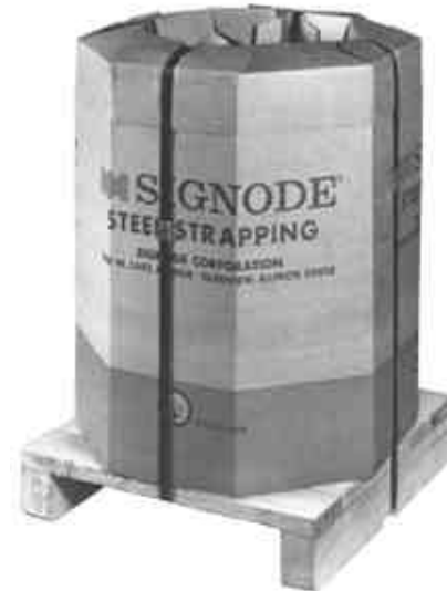
Mill wound skid

1-1/4" x 0.031" (31.75 x 0.8 mm) painted and waxed Magnus is available in a 220kg coil. Other Apex or Magnus sizes can be produced in 200kg or larger coils on a special manufacture basis. Contact your Signode sales representative for details.