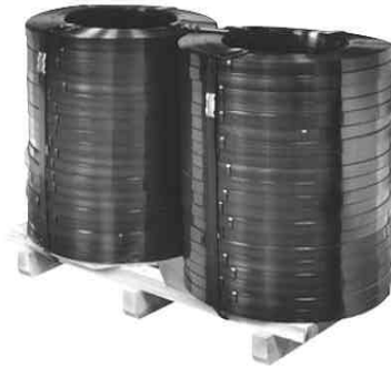
Ribbon wound skid